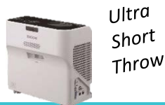
Ultra Short Throw